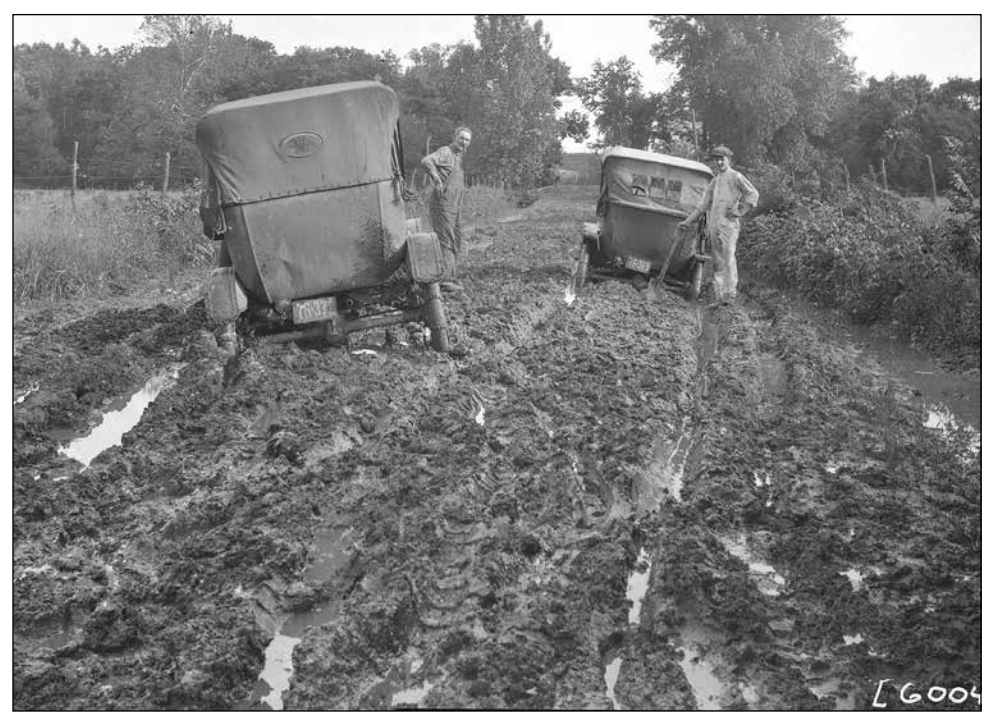
When the dirt roads were subjected to heavy rains, they became a quagmire. Roads or sections that were continually wet, as from springs, were sometimes covered with half-logs or wide planks, creating a plank or corduroy road.

When they came by father's home, they thought the horses were going to go over the fence. Dad had the work horses out in a pasture near the road and when they saw and heard this car they came running to the house near-